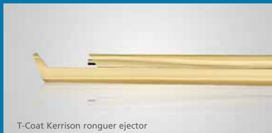
T-Coat Kerrison ronguer ejector