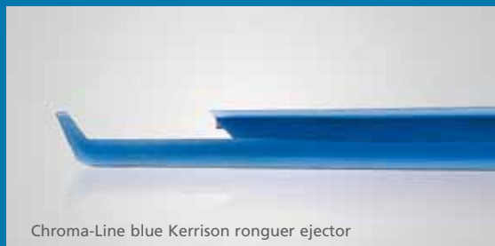
Chroma-Line blue Kerrison ronguer ejector